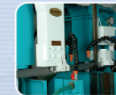
Roller Bearing / Carbide wear pad Blade Guide System