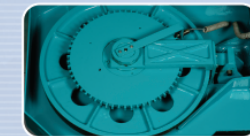
Idler Wheel Motion Detector with Blade Stalling & Breakage shut off